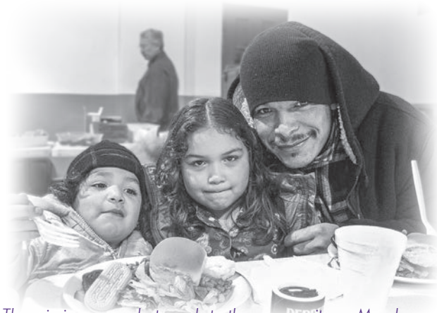
The mission serves hot meals to the community on Monday and Friday evenings, as well as distributing groceries on Wednesdays.