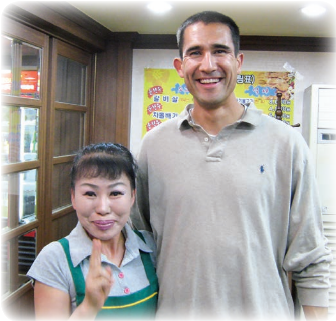
Set your mind on things above...