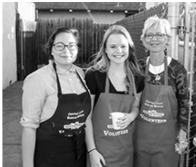
These ladies are part of the Element Church youth group, which serves dinner once a month