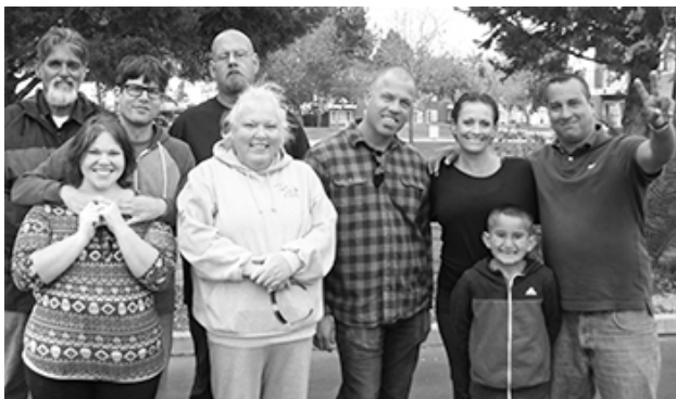
The partnership between Coast Valley and the Rescue Mission breaks new ground on Monday evenings.

The mission looks to work with churches, where people matter, even though a person might not have anything in their bank account. A person can never be so stuck in an addiction that the grace of God cannot set them free.