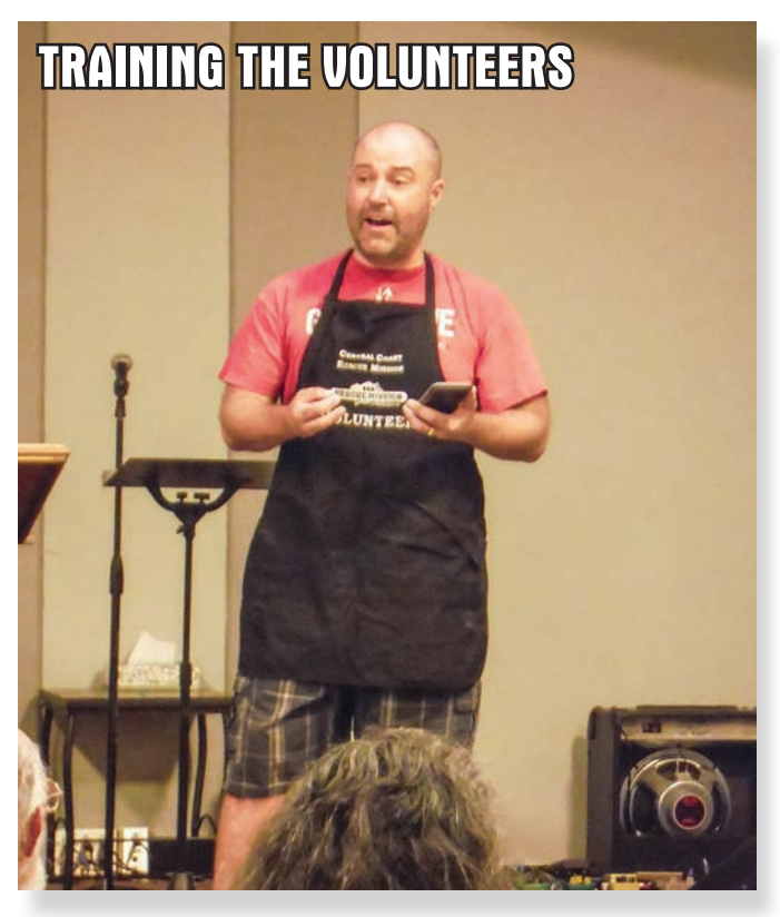
Success in rescue ministry has a lot of variety – training our disciples to serve the poor, engaging volunteers to serve and to share the Bible, seeing kids smile for a hot dinner, and lots more.

"Getting baptized at Bass Lake was beautiful, man! It was like a weight was taken off of me and I became a new man. Everyone should get baptized!"